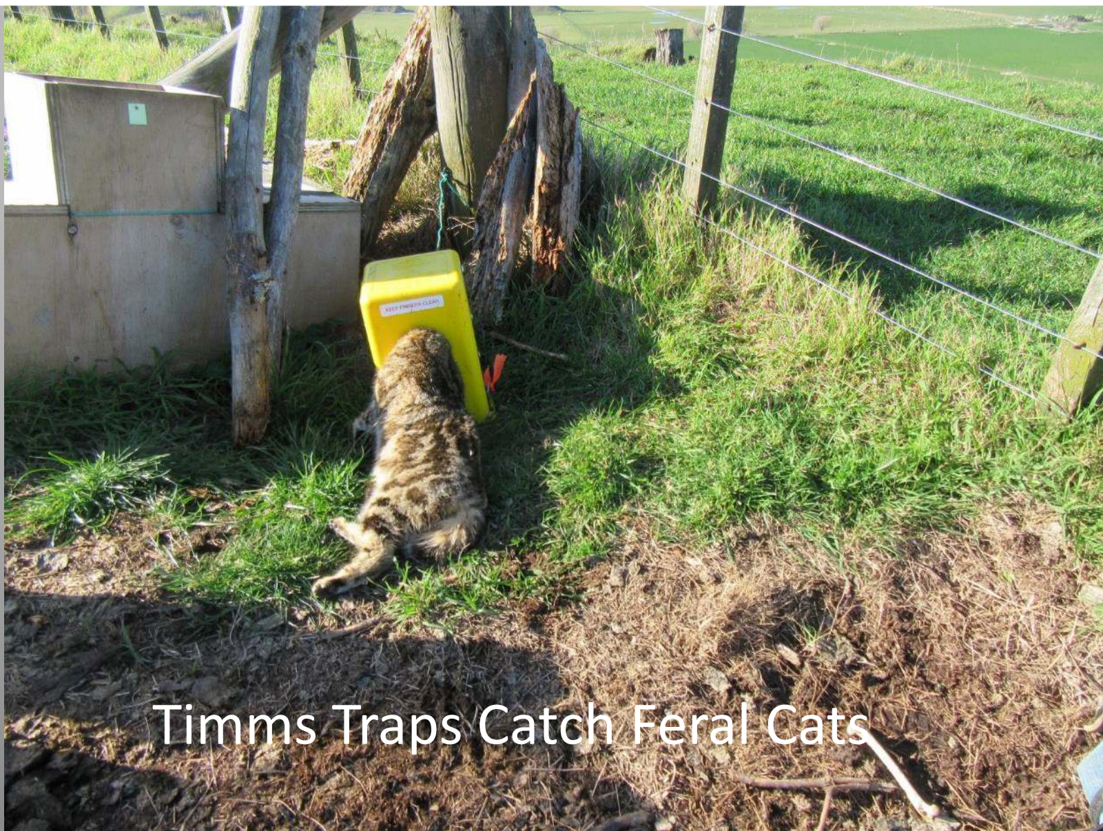
Timms Traps Catch Feral Cats