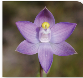
Native striped sun orchid, Thelymitra pulchella .

Gumland is often confused with scrub but a closer look will reveal a unique community of plants many of which are shared with the acid, infertile bogs. Stunted, short manuka may be dominant. Schoenus brevifolius and Baumea sedges (wiwi), tangle fern ( Gleichenia dicarpa ) and Dracophyllum lessonianum can be abundant. A search on the ground and along track edges will reveal a treasure trove of native orchids, tiny ferns and sundews, some of which are very rare.