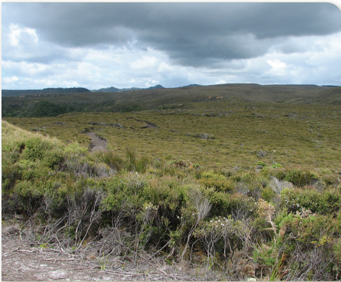
Epakauri Gumland south of Ahipara.

Gumlands are similar to the pakihi wetlands found further south. They are the least fertile and most acidic of the wetlands and are normally found on gently sloping ridges where ancient kauri forests once grew. Over thousands of years the kauri dropped acid litter causing nutrients and organic material to leach out of the soil. This left behind a hard silica pan (base) which is a barrier to water draining away. Fires are a feature of gumlands causing further loss of nutrients. Gumlands are often not recognised as wetlands because they are on hilltops. In summer they can dry completely and in winter they may be water logged. They receive all of their water from rain. In hollows, wet peat bogs can form (see Bogs fact sheet).