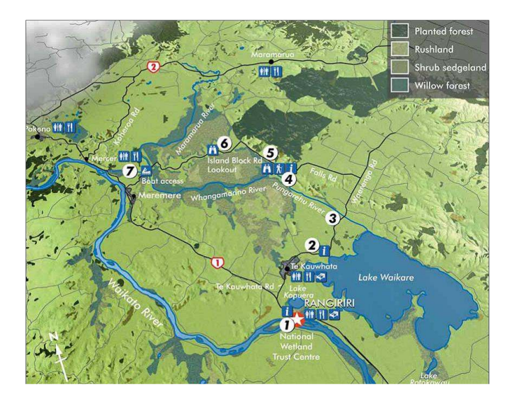
Map from Whangamarino and Lake Waikare Trail Guide

Check that you are not breaching any copyright with the map you intend to use – do not scan or photocopy a commercial map without permission.