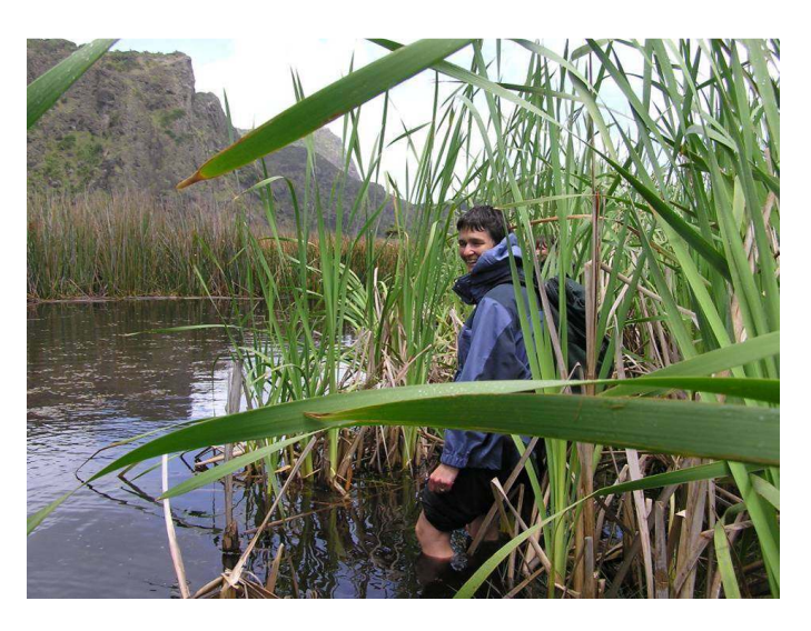
Most wetlands are difficult to access!

Driving and walking trails that take people to and through publicly and easily accessible wetlands will help increase wetland appreciation and protection.