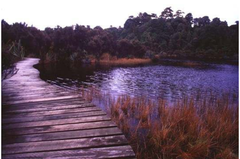
Provide a pleasant outdoor experience

Avoid areas of such high value and sensitivity that increasing visitation would threaten their existence.