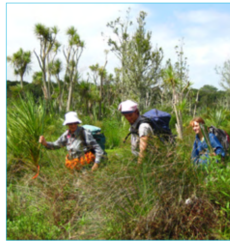
Right: The team at work in re-constructed urban wetland, Waatarua Reserve, Meadowbank.

to see if its policies, wetland protection rules, and programmes are working, or if they need to find another approach, or tackle a new threat.